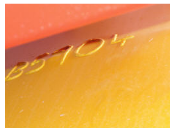
Welded ID confirms rightful ownership

Mtrack continues to succeed in the most challenging of asset tracking environments, supporting an enviable 98% recovery record, in one covert and affordable battery powered unit.