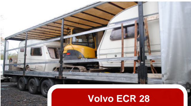
Volvo ECR 28 Tracked from Birmingham